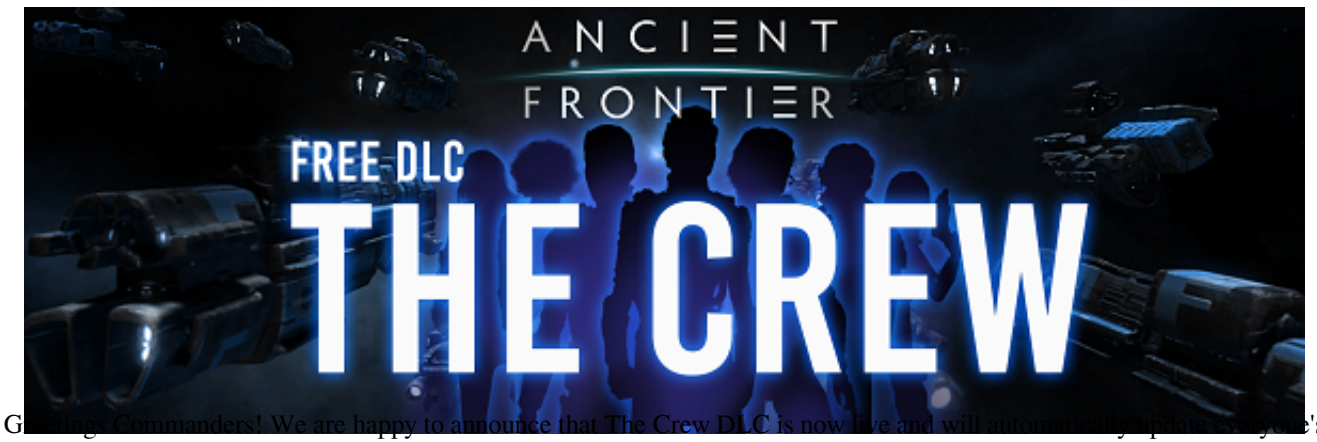
game. This DLC is completely FREE as a thank you to all of our new and old fans. This new DLC introduces quite a few changes, so keep reading for the full change log.